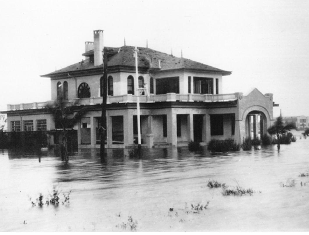
Flooding surrounds the clubhouse in 1921 after a hurricane.