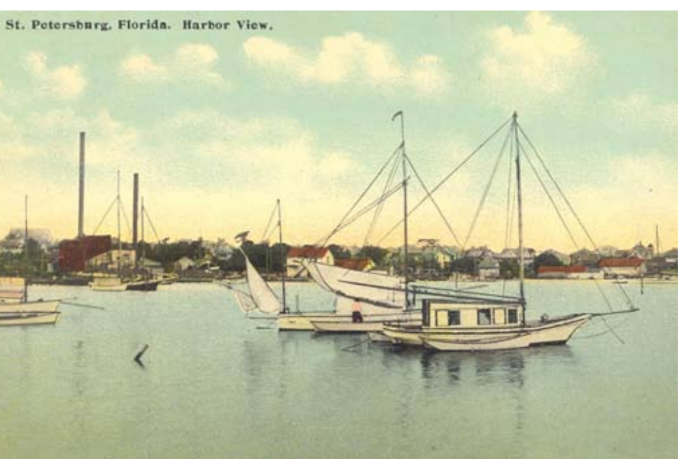
An idealized vision of the pre-yacht club era waterfront was captured on a postcard, circa 1900.