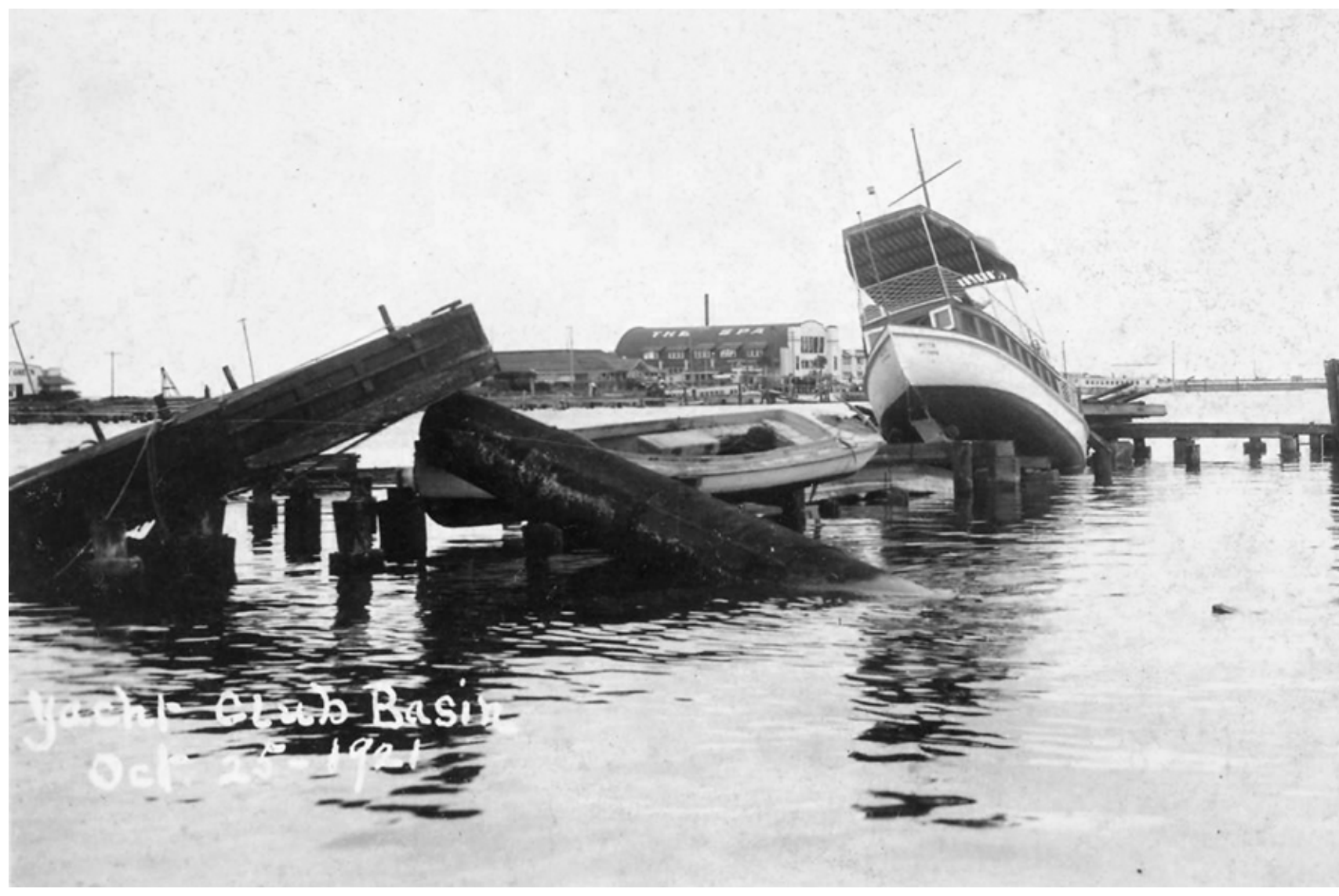
Many vessels suffered damage during the 1921 hurricane. The Spa Pool building appears in the background.

The ballroom in the expanded clubhouse was the scene of many brilliant social events, and the club came into its own as the social center of St. Petersburg. Many internationally famous figures who visited the city aboard their yachts were entertained by members of the St. Petersburg Yacht Club. The paired strengths of the club as a social center and as promot-