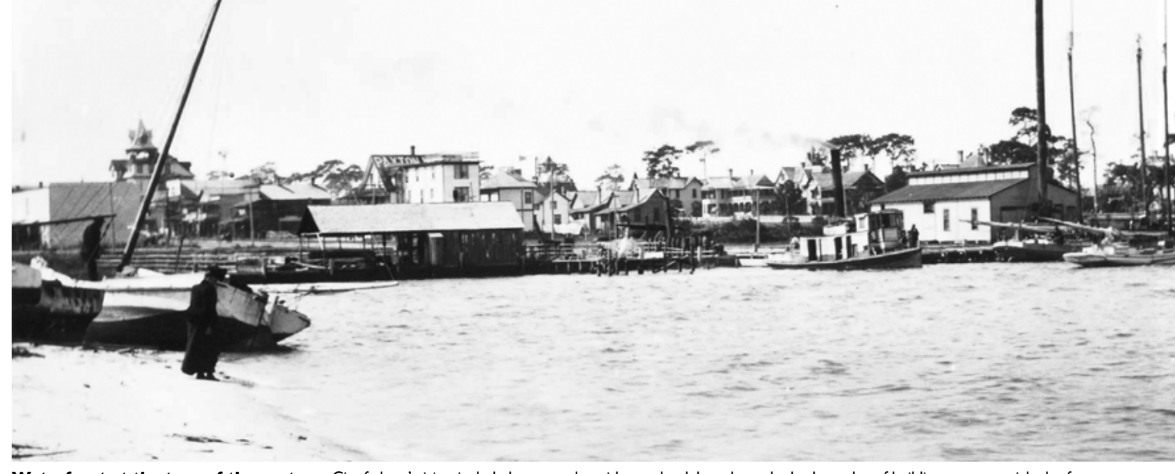
Waterfront at the turn of the century: City fathers' vision included open parks, with a yacht club, and not the hodgepodge of buildings, commercial wharfs and derelict boats. The power plant, right, was built in 1899 over the water at the site of SPYC's present parking garage. A plaque in the sidewalk on Central Avenue commemorates this historical fact.

Previous pages: The SPYC clubhouse, 11 Central Ave., as seen from the southwest about 1919.