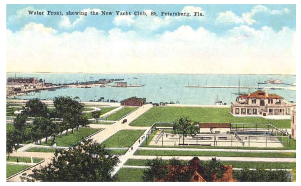
A postcard circa 1917 shows the Tampa Bay waterfront that includes the new SPYC building. Building to the left is Home Line Freight House.

clubhouse in the face of a legal opinion that the lease to a private club of city-owned waterfront property was void. A special act by the 1917 Florida Legislature declaring the lease valid cured that problem. All officers were re-elected in 1917, and an elegant clubhouse was formally opened June 15, 1917, on the northwest corner of Bayshore Drive and Central Avenue. Bonds of $20,000 were issued to reimburse members for loans used to fund the construction. George S. "Dad" Gandy, of Gandy Bridge fame, succeeded Carley as commodore in 1919.