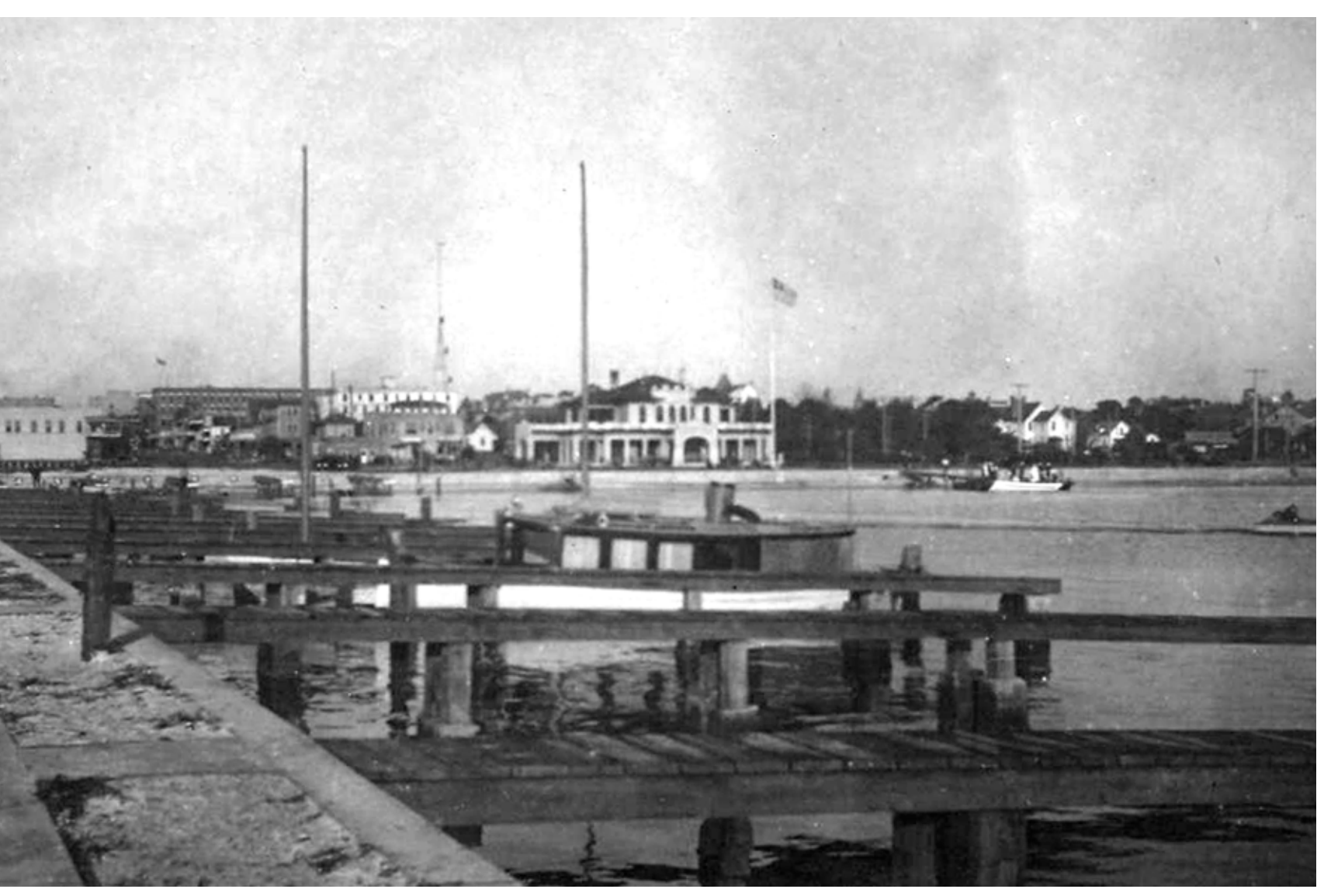
A view from the First Avenue South railroad pier shows the clubhouse about 1919.